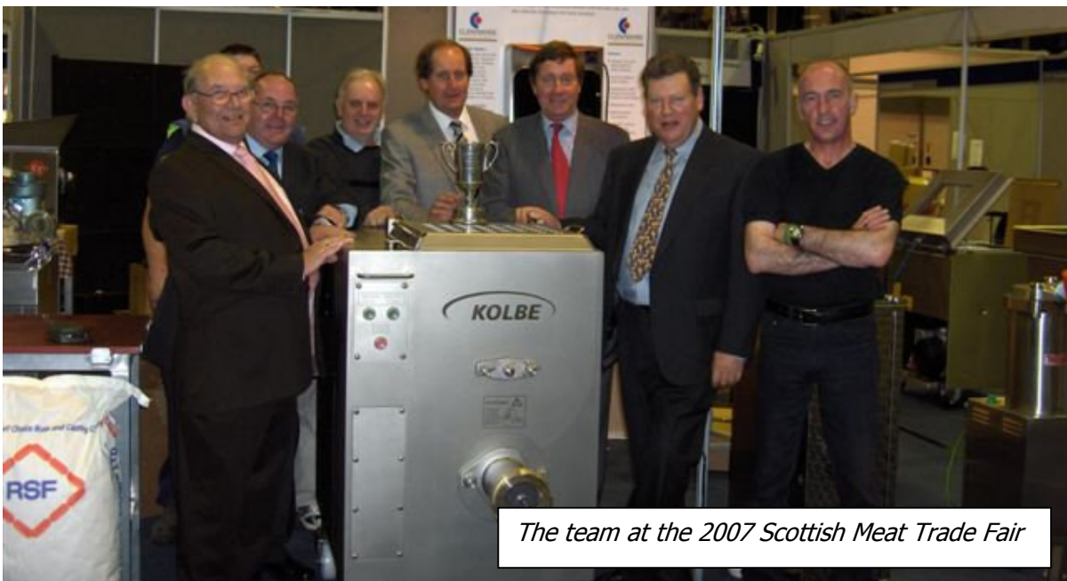
The team at the 2007 Scottish Meat Trade Fair